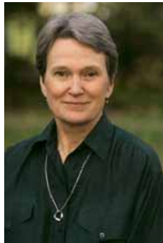
Assemblywoman Loni Hancock