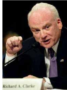
Richard A. Clarke

Members of the book group invite you to join them on Thursday, February 16, at 10:30 AM in the League Office, 100 E Street, Suite 209, Santa Rosa, to discuss Richard Clarke's The Scorpion's Gate .